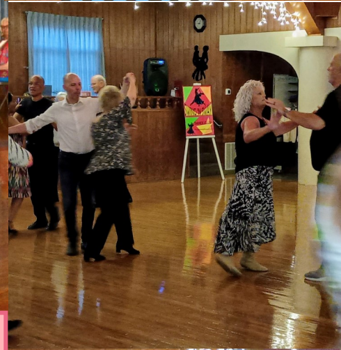
Swing 'n Sway Motown Dance Party