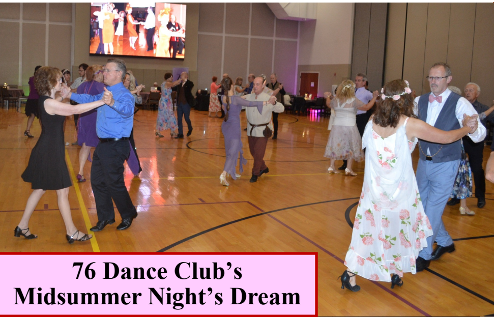
76 Dance Club's Midsummer Night's Dream