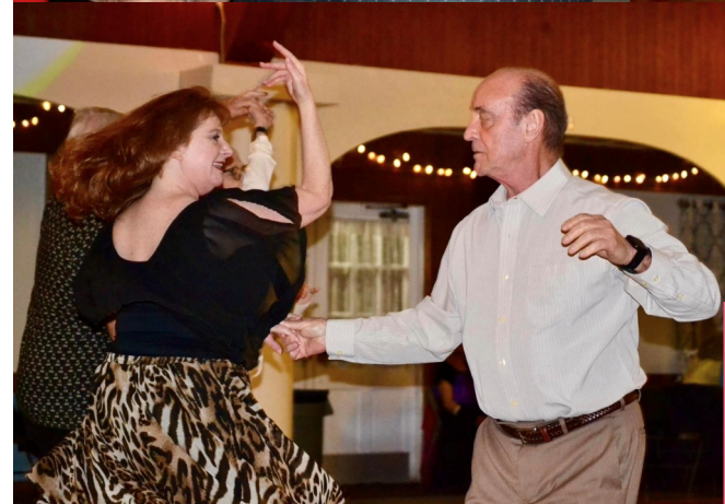
Stardust Dance Club