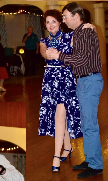
Swing 'n Sway