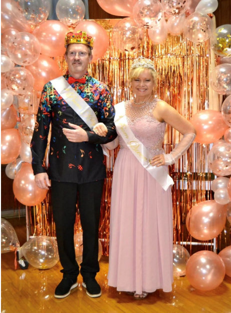
Prom King & Queen