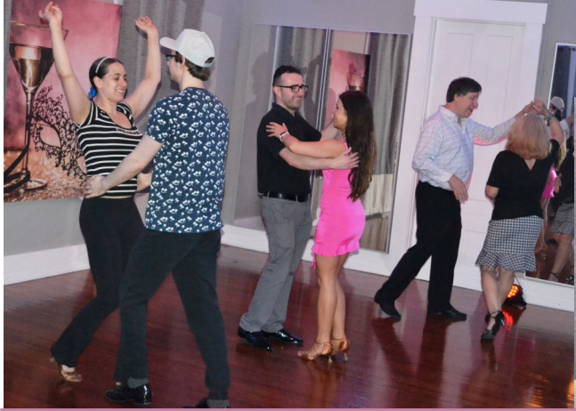
Double the Fun With the 76 Club @ the Dayton Dance Center