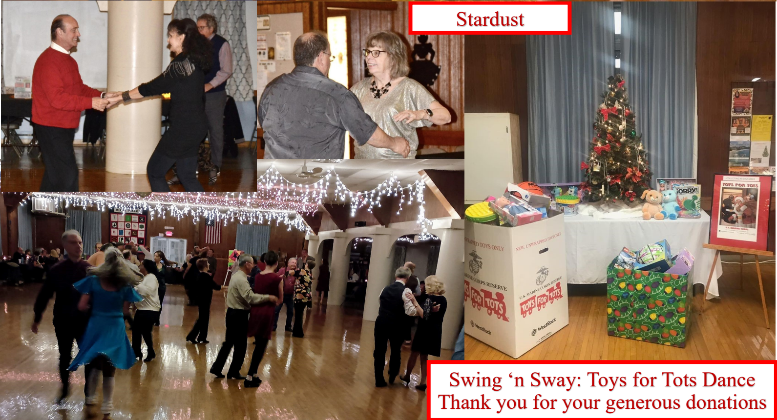
Swing 'n Sway: Toys for Tots Dance Thank you for your generous donations